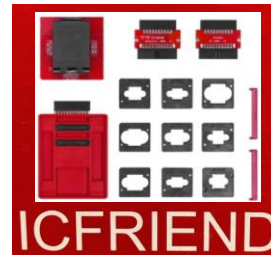
ICFRIEND NB eMMC BGA 13 in 1 eMMC Adapter P2 8-in-1 Socket Adapter Medusa Pro EMMC A3 Adapter UFI EMMC A2 Adapter Flash Memory Adapters – 9 pcs.