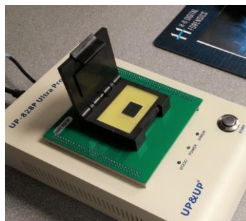
UP-828P Universal Programmer – Reader Includes the Vehicle BGA63NP and IoT BGA67NP Adapters