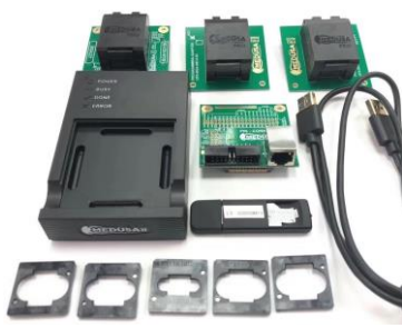
Medusa Pro II with Socket Kit UFS BGA-095 Socket Adapter UFS BGA-153 Socket Adapter