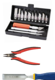
X-Acto Knife Kit, Wire Cutters, and Chisel