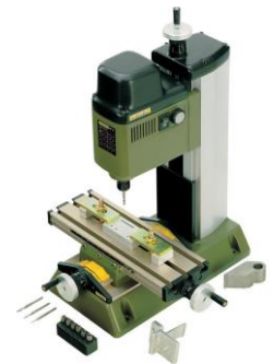
Micro Mill, Machine Block, and Milling Bits