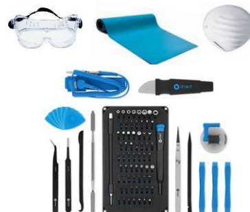
iFixit Pro Tech Toolkit and PPE: Goggles, Dust Mask, Anti-Static Mat