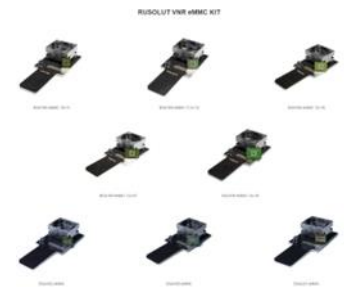
Rusolut - VNR eMMC Kit Includes: BGA162; BGA186; BGA221 adapters; and the BGA169e 10*11; 11,5*13; 12*18; 12*16 and 14*18 eMMC adapters