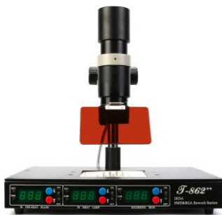
IR Rework Station