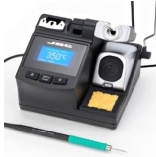
JBC Soldering Station