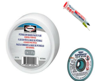
Soldering Flux, Solder Paste, Tape, and Other Supplies

* Hardware tools and toolkits are subject to change, a comparable/equivalent tool will be substituted